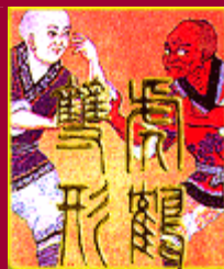
Lam Sai Wing TIGER & CRANE DOUBLE FORM