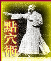
Jin Jing Zhong DIAN XUE SHU: SKILL OF ACTING ON ACUPOINTS